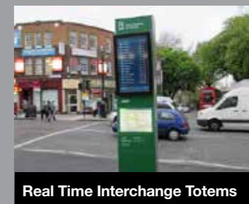
Real Time Interchange Totems