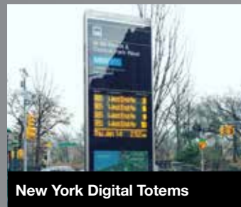
New York Digital Totems