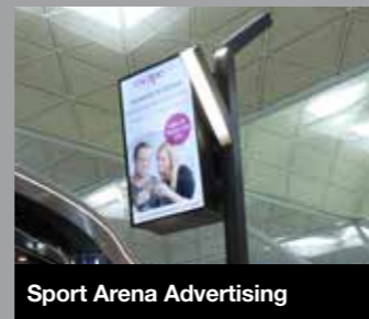
Sport Arena Advertising