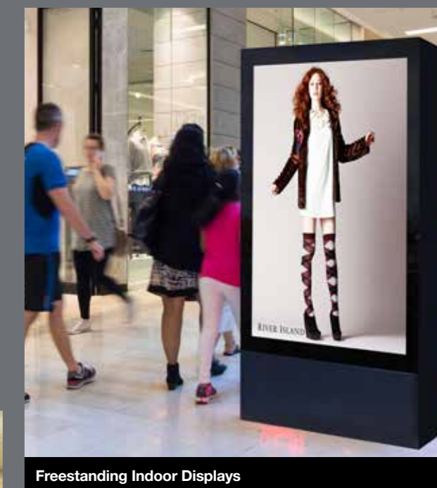
Freestanding Indoor Displays

Available in both 75" and 86" TFT display sizes, the Fuzion D6 range provides near full 6 sheet display size visibility.