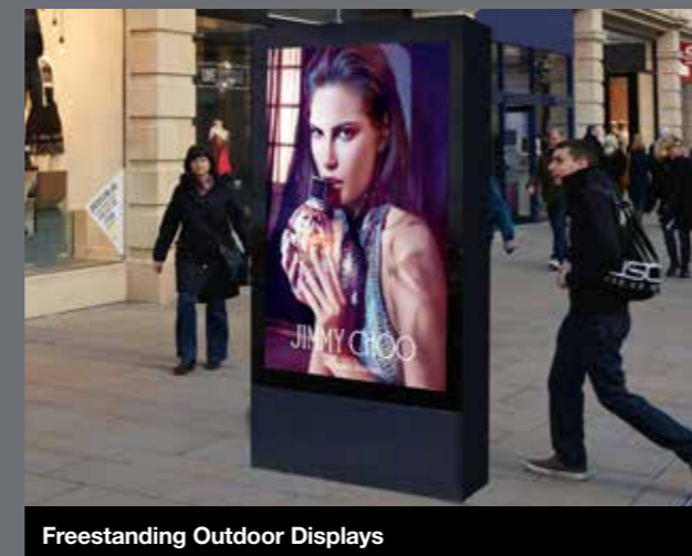
Freestanding Outdoor Displays

Following Future Systems's 40+ year experience in the design and manufacture of exterior digital displays for public transport environments and the subsequent successful roll out of digital outdoor advertising displays at locations throughout the World over the last 10+ years, Future Systems has continuously innovated its digital display range to ensure optimum performance and reliability.