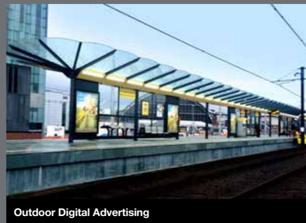
Outdoor Digital Advertising

Working closely with public transport authorities, outdoor advertisers, retailers and the DOOH market, Future Systems are able to provide proven, cost effective solutions for both single and double sided digital displays in a range of attractive enclosures, for a multitude of industry sectors and applications.