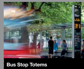
Bus Stop Totems