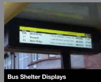
Bus Shelter Displays