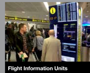
Flight Information Units