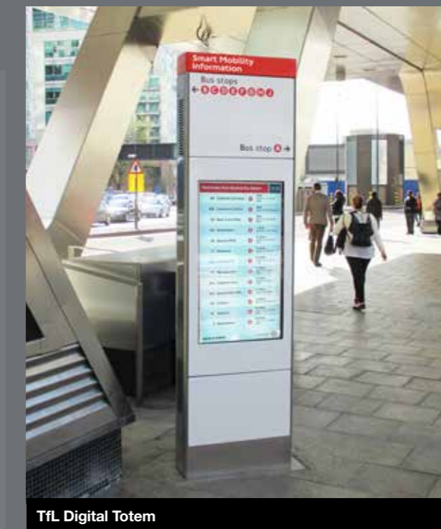
TfL Digital Totem

In house manufacture for quick, responsive delivery. Expertise in adapting and integrating to support your display needs.