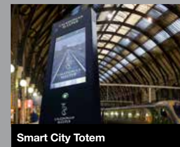
Smart City Totem