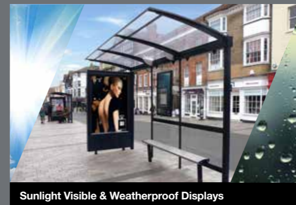
Sunlight Visible & Weatherproof Displays

Operating internationally, Future Systems have products in place throughout the UK, Europe, Canada, USA and the Middle East. Our clients range from leading Transport Authorities, such as Transport for London and New York Department of Transport, through to outdoor advertising companies, retail brands and shopping centres.